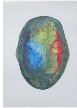
Size: 38 X 28 cm Handmade paper