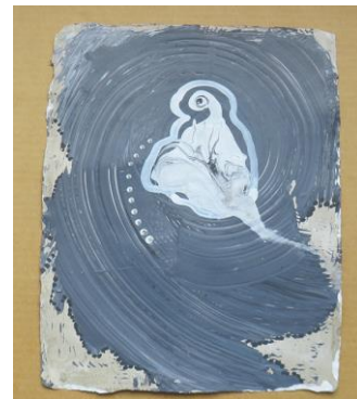
Size: 28 X 22 cm Handmade paper