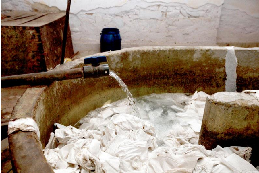
Water and cotton pulp making