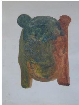
Size: 28 X 22 cm Handmade paper