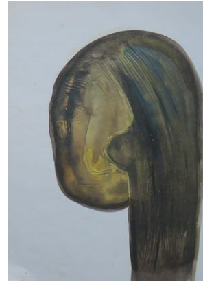
Size: 38 X 26 cm Handmade paper