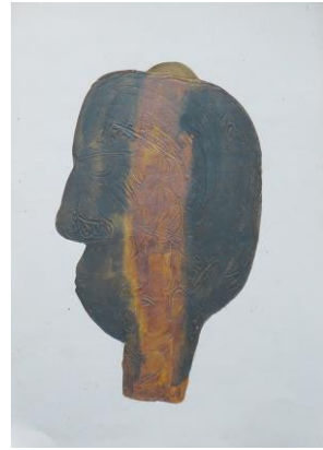
Size: 38 X 26 cm Handmade paper