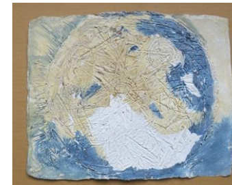
Size: 28 X 22 cm Handmade paper