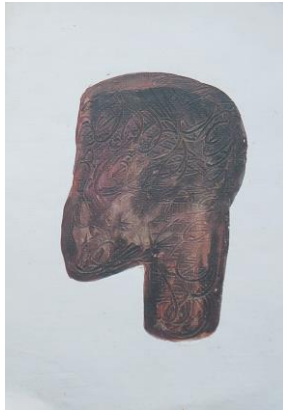
Size: 38 X 26 cm Handmade paper