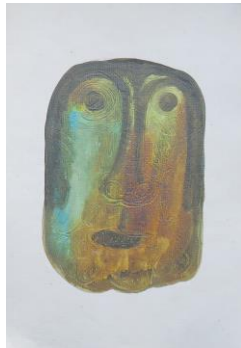
Size: 28 X 22 cm Handmade paper