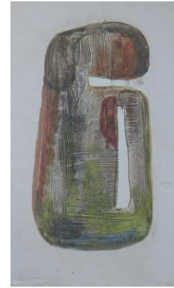
Size: 38 X 26 cm Handmade paper