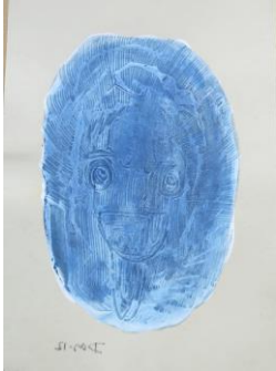
Size: 30 X 20 m Handmade paper