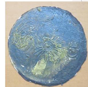
Size: Dia 24 cm Handmade paper